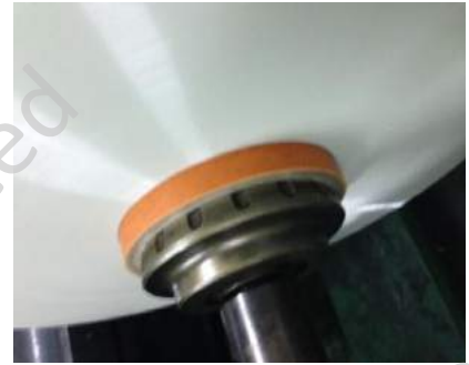
Paper core width 950mm (roll width: