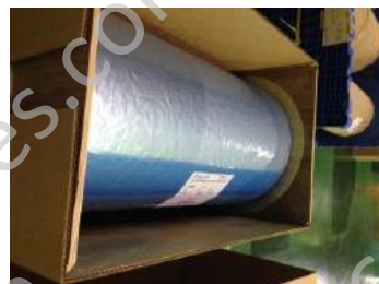
Dehumidification material in each ca