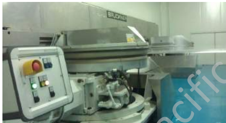
Bruckner Machinery, 5800mm width