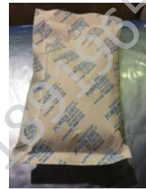
Dehumidification material in each ca